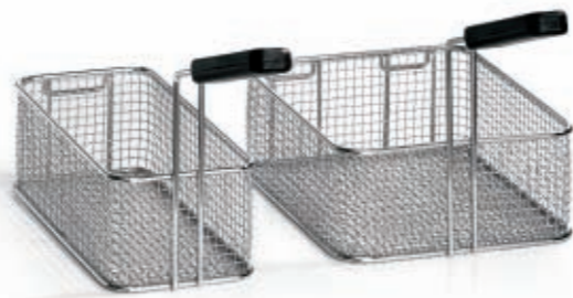
Supplied with chrome-plated wire mesh baskets