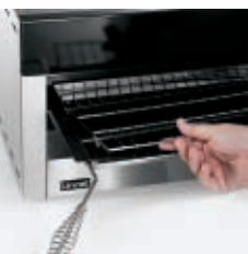
Model LGT supplied with grill pan and toasting rack