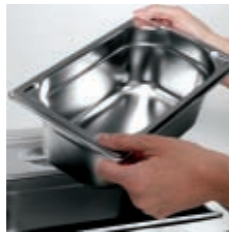
Supplied with stainless steel GN containers