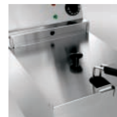
All Lynx 400 fryers are supplied with lids