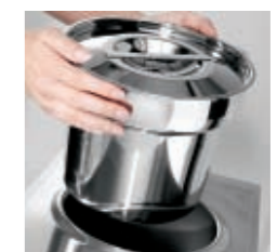
Supplied with stainless steel round pots