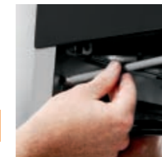
User-changeable quartz infra-red elements