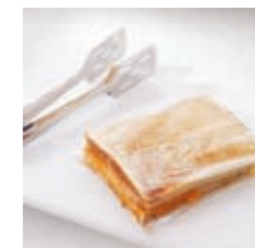
Optional toasting bags (TO10)