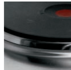
Sealed hotplates for easy cleaning