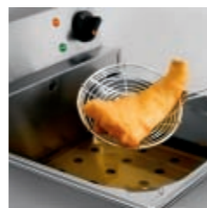
Large tank in LFF is ideal for free frying