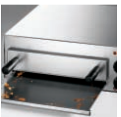
Large crumb tray for easy cleaning