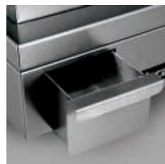
Large fat collection drawer