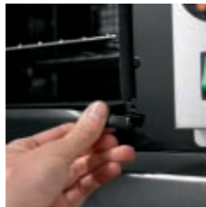
User-replaceable door seals