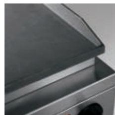
One-piece cast iron griddle plate