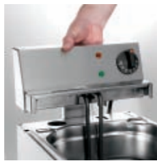
Control head fits securely in place