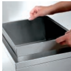
Removable tank allows wet heat models to be operated with dry heat