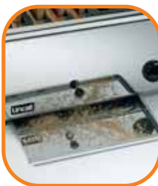
Large full depth crumb tray