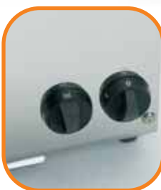
Slot selector and timer switches